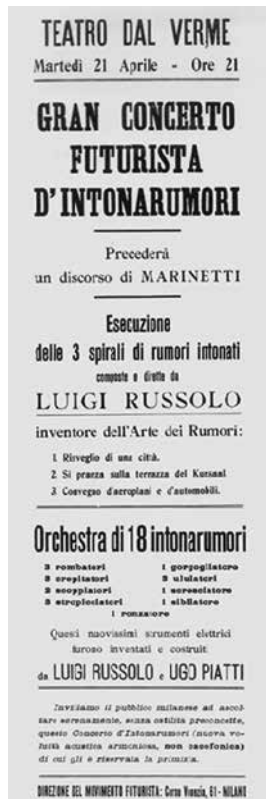
Figure 3. Poster of the Gran concerto futurista at the Teatro dal Verme in Milan, on 21 April 1914

Russolo and Piatti brought out the first noise instrument they had constructed: the scoppiatore , which produced a sound typical of a combustion engine. The three others, crepitatore , ronzatore and stropicciatore had not been finished on time. The device was placed on a table in front of the spectators, „like a sacred, mystic, supernatural object“, wrote the Gazzetta dell'Emilia ([Anon.] 1913). However, the audience regarded the machine as something comical or even grotesque and reacted accordingly. Russolo had to consult with Marinetti on how to proceed with the show, for in the din created by the audience it was impossible to give the instrument a proper hearing. Finally, Marinetti came to the footlights and spoke about Russolo's great invention, how it was going to feature in Pratella's new opera, L'aviatore Dro , and how they were going to construct a whole orchestra of intonarumori . When, finally, Russolo and Piatti demonstrated their machine, the audience shouted: „It's all a cheat! Open the box! You are imitators and passéists! Why listen to a fake noise when we can hear the original sound every day on the street?!“ ([Anon.] 1913). Apparently, the 'noise orchestra' in the auditorium drowned all the sound that issued from the instrument on stage.