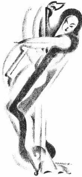
Figure 7. Wy Magito in Théâtre de la Pantomime futuriste