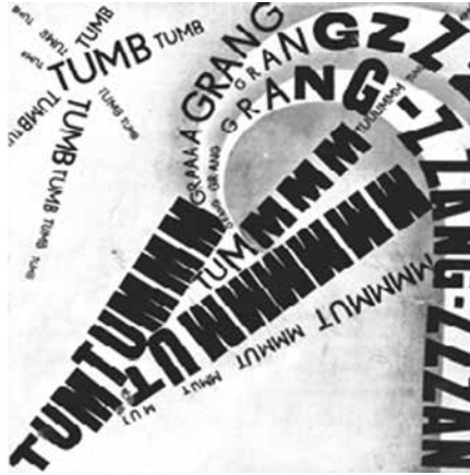
Figure 1. A page from F.T. Marinetti and Tullio d'Albisola: Parole in liberta futuriste olfattive tattili-termiche . Savona: Edizioni futuriste di poesia (Lito-Latta), 1932.

In a report on one of his many recitations of Il bombardamento di Adrianopoli , at the Teatro Lírico in Rio de Janeiro on 15 May 1926, the newspaper A manhã wrote that the poet's unconventional poetry delivery was „full of noise: battalions marching, bugles, whistles, screams, the cries of wounded soldiers, bursts of shrapnel, fusillade, roaring engines, the noise of falling buildings“ ([Anon.], 1926: 9).