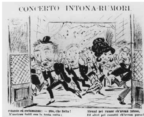
Figure 4. Caricature of the concert at the Dal Verme Theatre, 1914

The three compositions that had been announced in the programme were Risveglio di una città (Awakening of a City), Colazione sulla terrazza del Kursaal Diana (Breakfast on the Terrace of Kursaal Diana) and Convegno di automobili e di aeroplani (A Meeting of Automobiles and Aeroplanes). On the poster, Marinetti had expressly stated: „We invite the Milanese public to set aside any premeditated hostility and listen quietly to the voluptuous acoustics in this first concert of intonarumori “ (see Fig. 3). But as was to be expected, exactly the opposite took place. The sight of the unusual orchestra was greeted with laughter and the music was frequently interrupted by witty interjections and mocking comments (see fig. 4). Then, the situation got out of hand. Il secolo reported: „The spectators took over and began their own spectacle. They shout, sing, laugh, make a loud clatter. The first potatoes come raining down from the balcony and mingle on stage with the flowers that some Futurist lady-friends had thrown earlier on“ ([Anon.] 1914: 5).