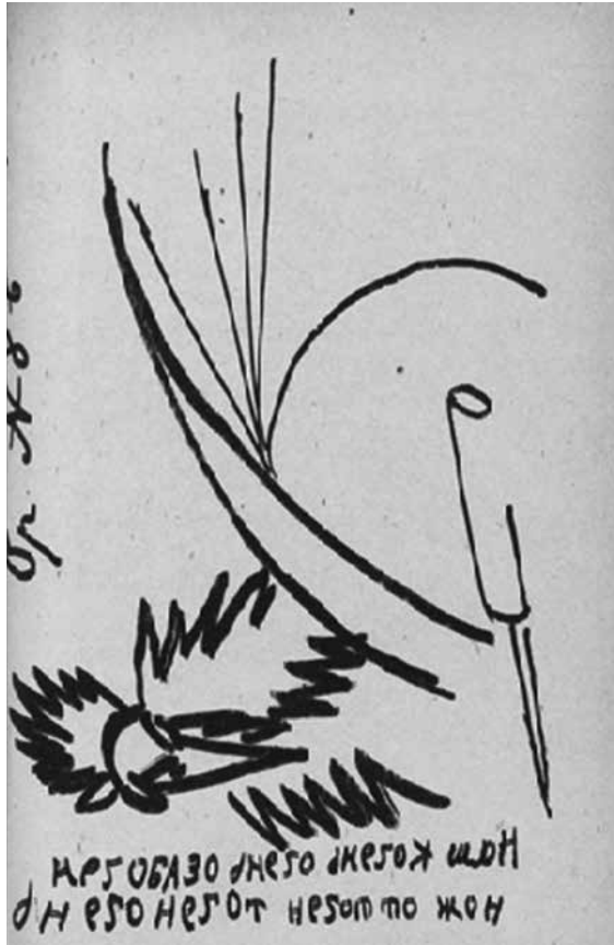
Figure 5. Larionov: „Nash kochen.“ A page from Mirskontsa (Worldbackwards, 1912).

In a number of essays and books published between 1918 and 1923, the Proletkult leaders Boris Kushner, Valerian Pletnev and Boris Arvatov developed a materialistic conception of noise art and advocated the substitution of conventional instrumental music with industrial noises. In the near future, they believed, conventional music would become obsolete for the proletariat. As Boris Kushner pointed out, it would be replaced by an ‘industrial music’: