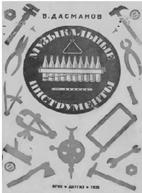
Figure 6. Cover of a handbook by Vladimir Dasmanov: Muzykal'nye instrumenty (Musical Instruments, 1935).

Another reason why workers would form musical ensembles that used materials from everyday life seems to have been related to the Marxist concept of overcoming alienation from the products of labour. These proletarian noise orchestras abolished the difference between material and cultural production, between work and leisure, between musical instruments and working tools. Closing the gap between art and life, between work and leisure, was a favourite dream of many Futurist artists. Sergei Eisenstein and Boris Yurtsev introduced noise art into their theatrical productions. In 1922/23, Eisenstein offered courses in noise music at the Moscow Proletkult (Eyzenshtein, 2005: 118), and Yurtsev published an article on „The Orchestra of Things“, in which he advocated the use of instruments made of „assorted things and materials [...] such as bottles, pans, basins, glass, nails, needles, concrete, wood and metal, selected according to timbre and richness of sound.“ He suggested an „orchestra related to individual industrial sectors“ and the formation of a „United Orchestra of the Central Trade-Union Council“ (Iurtsev, 1922: 22). In 1924, Eisenstein directed Sergei Tretyakov’s Gas Masks for Moscow’s Proletkult organization. It was staged in a real gas factory, and in its last scene the arriving night shift workers ignited gas jets to the sound of factory horns, pneumatic rattles, hammers riveting huge metal sheets, etc. (See [Anon.], 1924; Gordon, 1978).